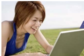
Patient Health Record Portal